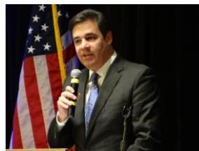
US Rep. Raul Labrador