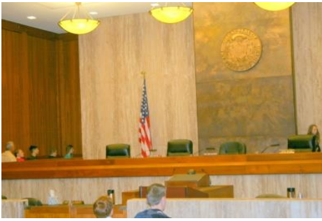
Idaho Supreme Court