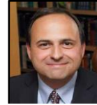
Tom Woods, Author, Historian, Speaker Mises Institute