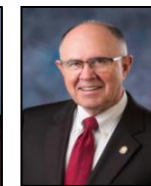
Chuck Winder Idaho Senate