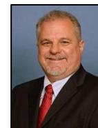
Bill Sali former U.S. Congressman