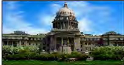
Idaho State Capitol

2015 Liberty Symposium June 17th, 18th, 19th & 20 th State Capitol- Boise, Idaho