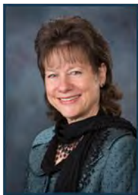
Sen. Sheryl Nuxoll Idaho Senate