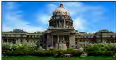
Idaho State Capitol

2015 Liberty Symposium June 17th, 18th, 19th & 20 th State Capitol- Boise, Idaho