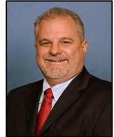
Bill Sali Former U.S. Congressman