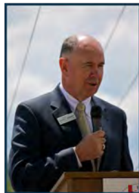
Sen. Chuck Winder Idaho Senate