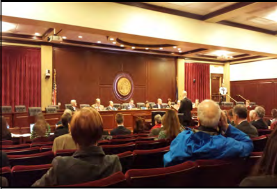
Campus Carry Hearing