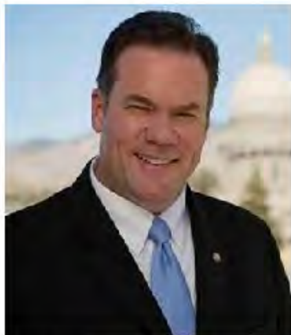
Senator Russ Fulcher for Governor