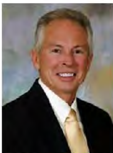
Todd Hatfield for State Controller